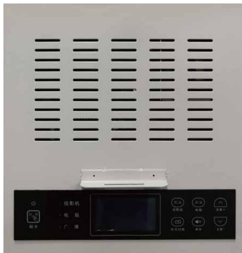
Central control system