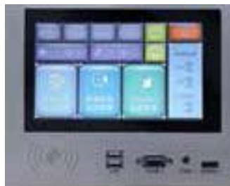
Central control system