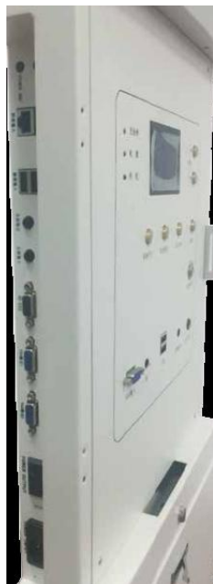
Central control system