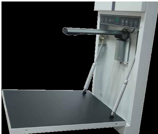
Central control system